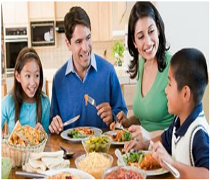
Reading Activities at Mealtime