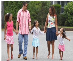
Reading Activities in the Neighborhood