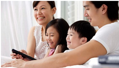
Reading Activities in Front of the TV